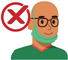
On your chin