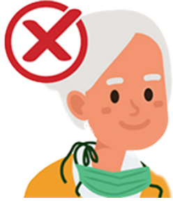
Around your neck