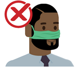
Only on your nose