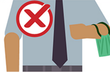
On your arm