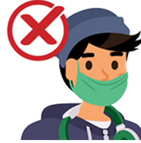
Under your nose