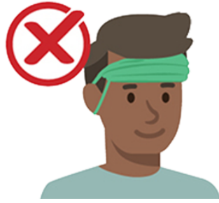
On your forehead