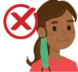
Dangling from one ear